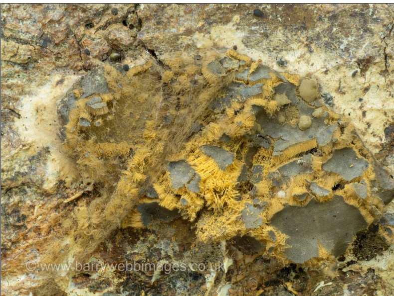
Left: the unusual slime mould Dictydiaethalium plumbeum (no English name) found by Barry on fallen rotten Birch.