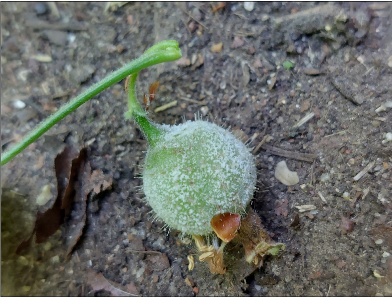
Left: the mildew Podosphaera mors-uvae (no English name) on wild Gooseberry spotted and later identified by Jesper. New to the site and with just one previous county record, this is one of two possible mildews on this host though only this species occurs on both leaves and fruits as here. (JL)