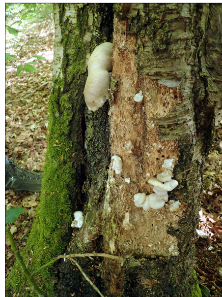
Above: Laccaria laccata (LR), and above right: Pleurotus ostreatus (PC)