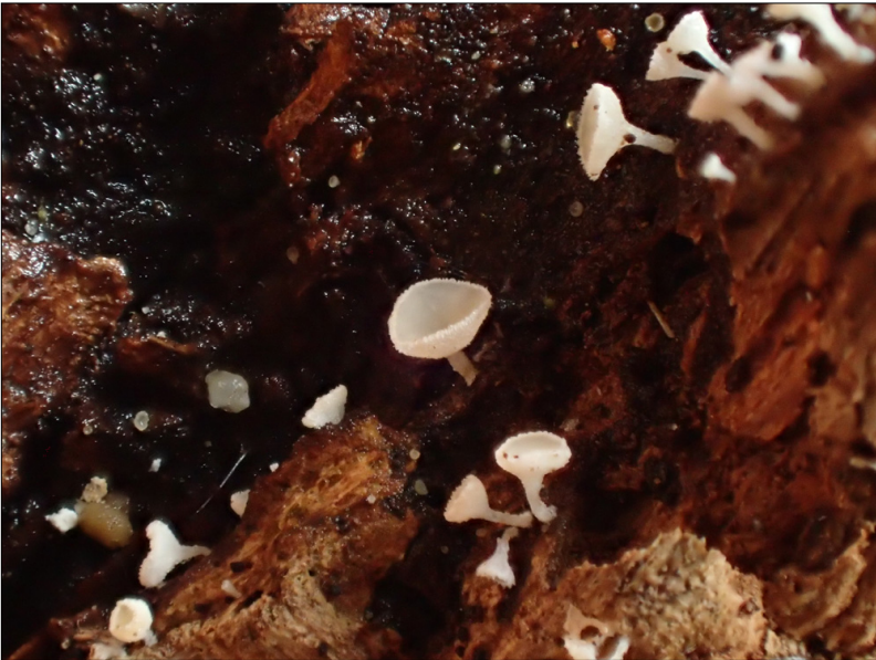
Left: Lachnum impudicum , one of two very similar white discos found today on rotting damp bare wood. (SJE)