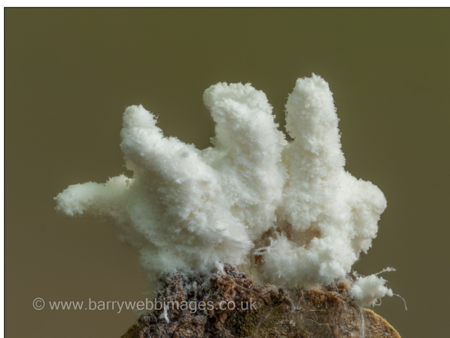
Below left: Cordyceps farinosa, and right: Trechispora mollusca