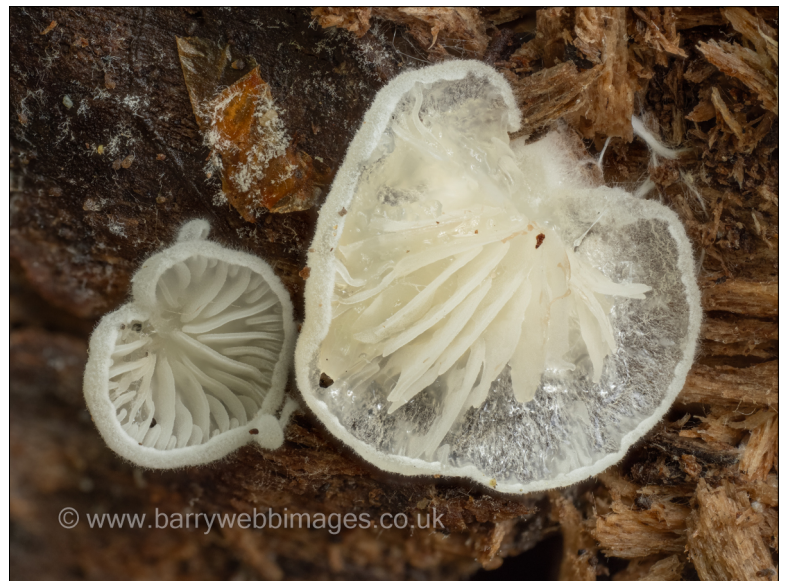
Above: our two tiny examples of Clitopilus hobsonii (BW)

Another gilled species worth mentioning: a few examples of a tiny white virtually stemless species shaped rather like a sea shell were found on rotten wood suggesting the genus Crepidotus (Oysterling). From its jizz it could well have been that genus (which needs a scope to determine to species in any case) but both Jesper and I had a feeling this was more likely to be Clitopilus hobsonii (Miller's Oysterling), in fact related to the much larger and stemmed C. prunulus (The Miller) - a species of grassy path edges. A spore print at home revealed the pink spores of this genus which also have telltale longitudinal ridges (a very unusual feature though often difficult to see convincingly even with staining) but here confirming our hunch. Not that rare, C. hobsonii is probably under-recorded and often misnamed as a species of Crepidotus .