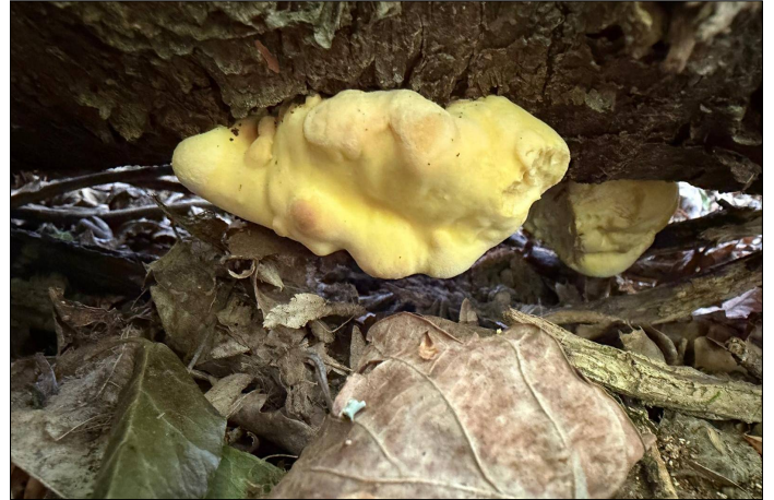
Above left: Jackrogersella cohaerens (a Woodward with no English name) liberally coating a dead Beech trunk (SJE), and right: the beginnings of the bracket Laetiporus sulphureus (Chicken of the Woods) spotted on fallen Cherry (AS).